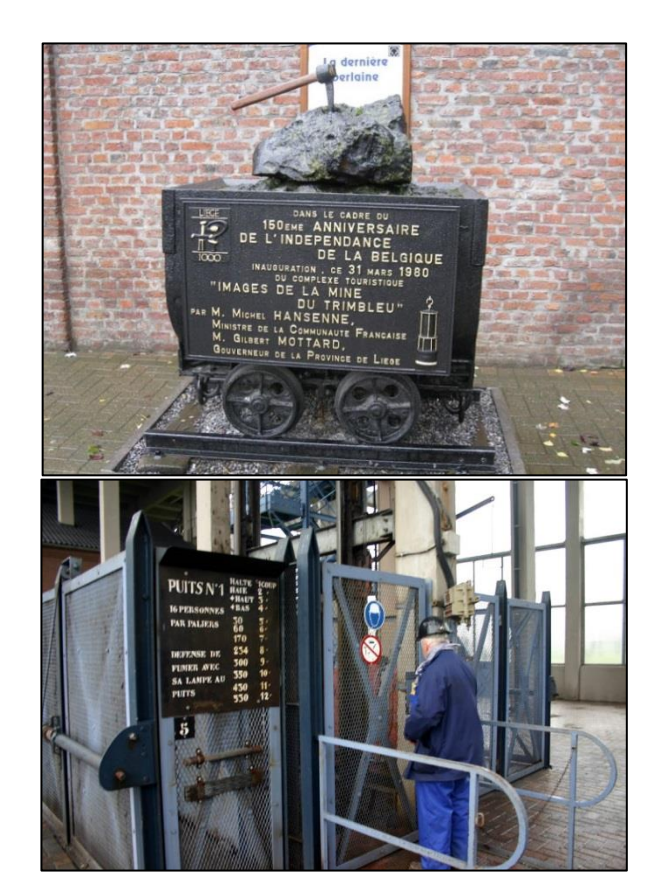
vidéo: https://www.youtube.com/watch?v=GB 1t2pSQg8